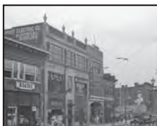
PATTON AVE. MOSKIN'S CREDIT CLOTHING

After the Depression, the block included Varsity Men's Shop, Doray's Millinery, Brenner's, Eleanor dress and hat shops and Wilkins's Corner soda shop, a popular meeting place. The block was torn down in the 1960s and replaced with the present Wachovia Bank building.