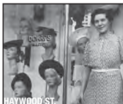
HAYWOOD ST. DORAY'S MILLINERY