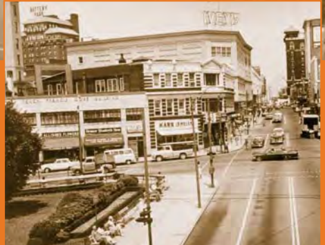
HAYWOOD / COLLEGE ST.